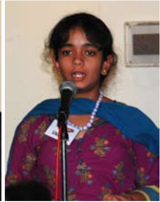
Teenage Student participants Art a Born to Excel workshop in Muscat in July 2010